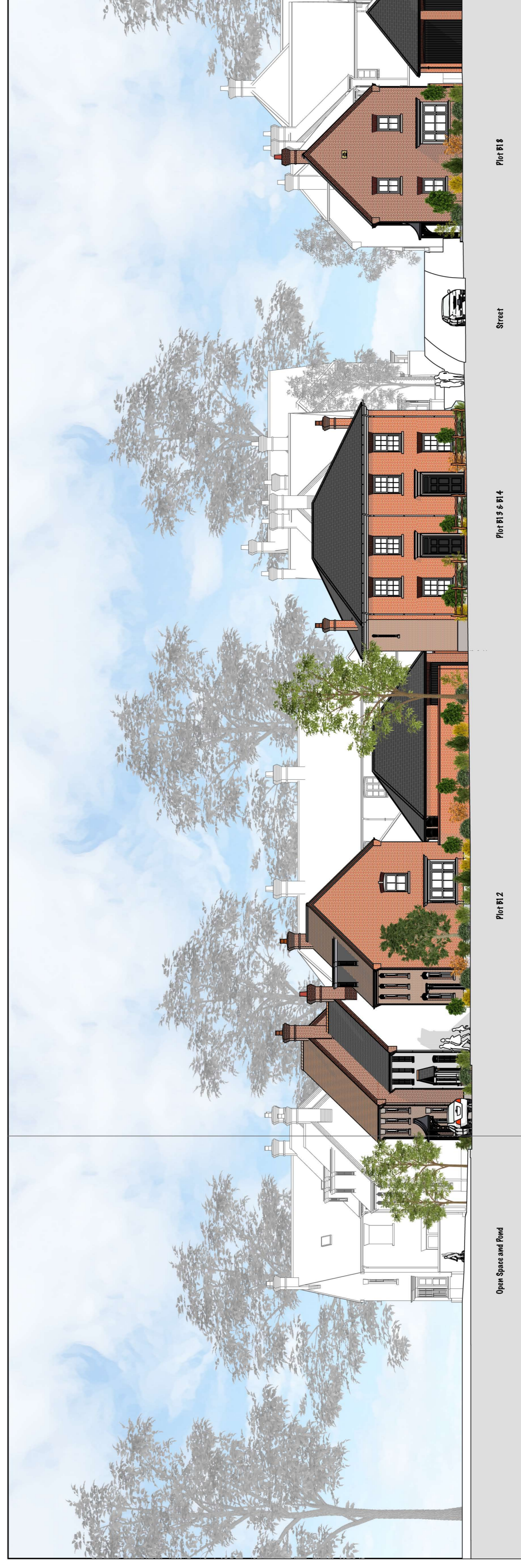
Section BB (East/Left Side)