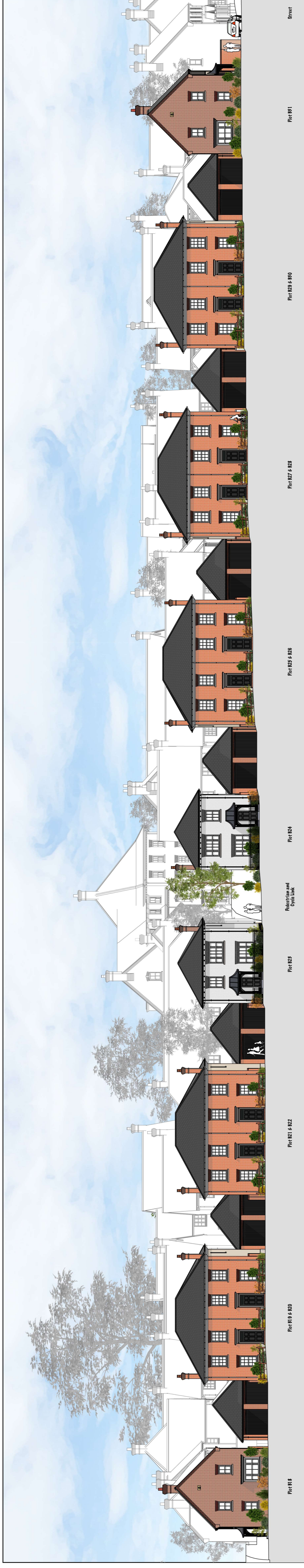
Section BB (West/Right Side)